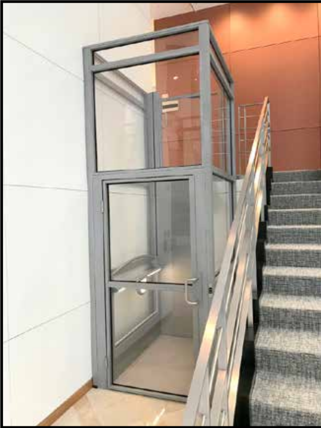
BlackRock Medical, New York, NY