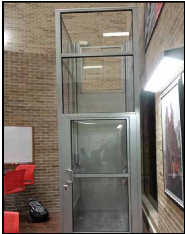
Texas Tech Holden Hall, Lubbock, TX