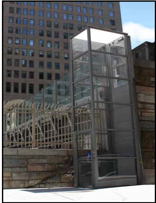
Morris Street Pedestrian Bridge, New York, NY