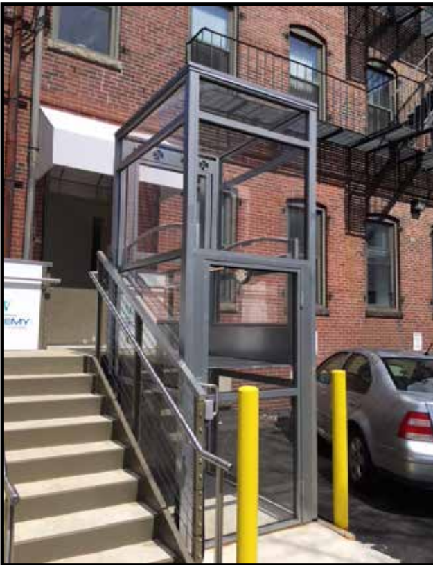
Woodrow Wilson Academy, Cambridge, MA