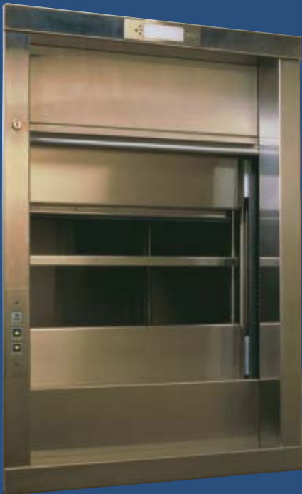
Optional stainless steel

Today, Waupaca Elevator continues to pursue cutting edge technology to enhance the convenience and affordability of its dumbwaiter line. Whether building new or remodeling, "Specify the Specialists" – Waupaca Elevator.